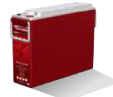
NSB 100FT HT RED