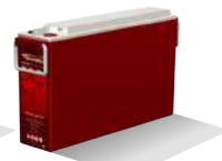
NSB 190FT HT RED