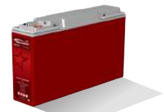
NSB 210FT HT RED