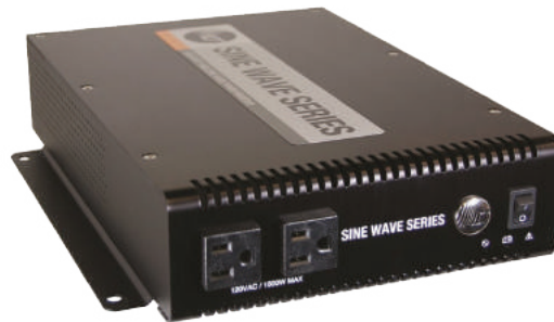
115 VAC Output Model Shown

1500 Watt DC to AC Pure Sine Wave Inverter for 115 or 230 Volt AC Applications